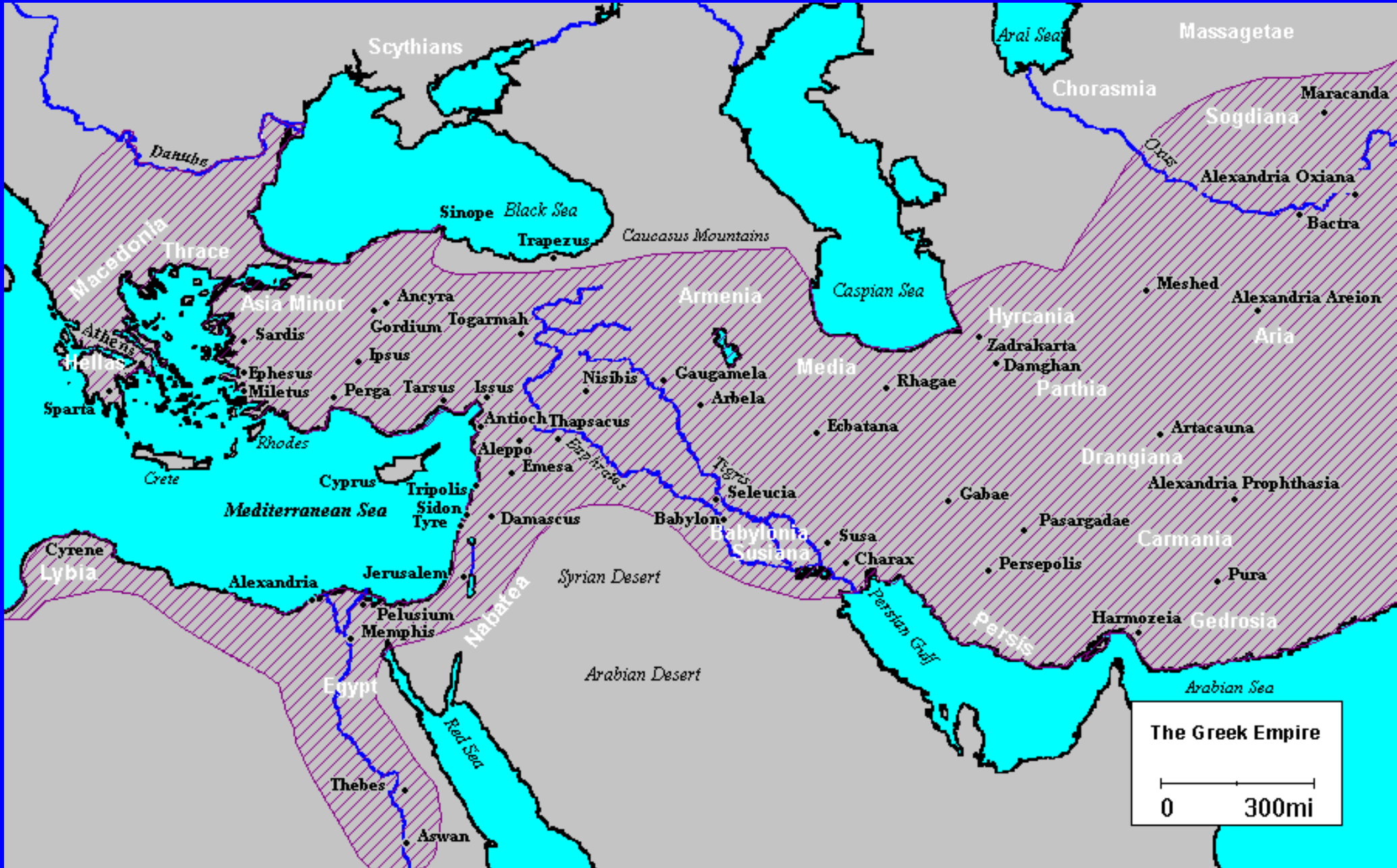
The Greek Empire 0 300mi